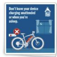
Personal Light Electric Vehicles