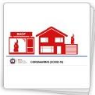
Covid-19 Fire Prevention Resources