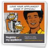
Awareness Days and Weeks