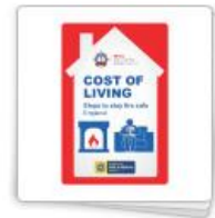
Cost of living fire safety campaign